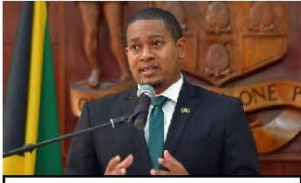
Minister Floyd Green,

The country's fisherfolk and farmers can now access insurance coverage for vessels, vehicles and accessories through Advantage General Insurance. The insurance package, developed in collaboration with the Ministry of Agriculture and Fisheries, was launched during a virtual ceremony yesterday. It is the first of its kind in the industry and will provide fishers registered with the National Fisheries Authority with access to insurance coverage developed specifically for their