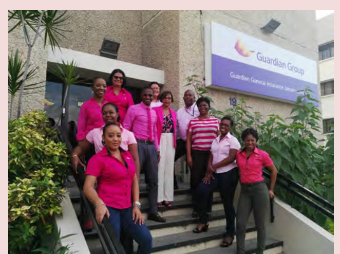
The GGJ team outside their doors at 19 Dominica Drive, Kingston 5