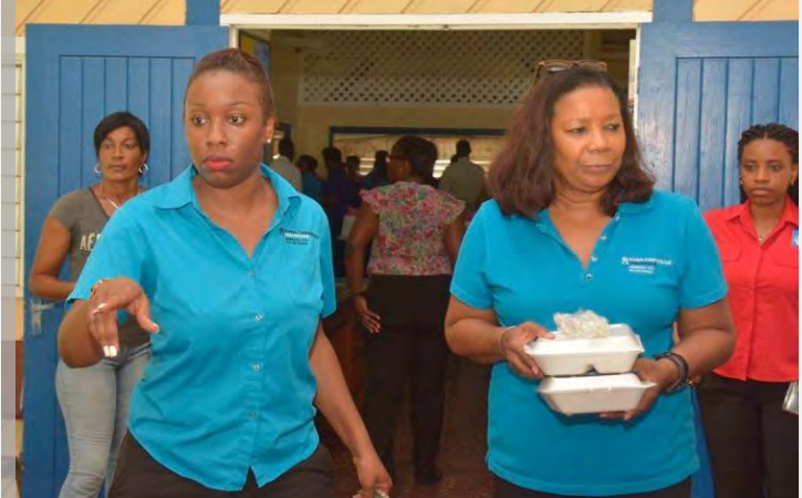
Treating 100 residents of the Bellevue Hospital to a full meal and care.